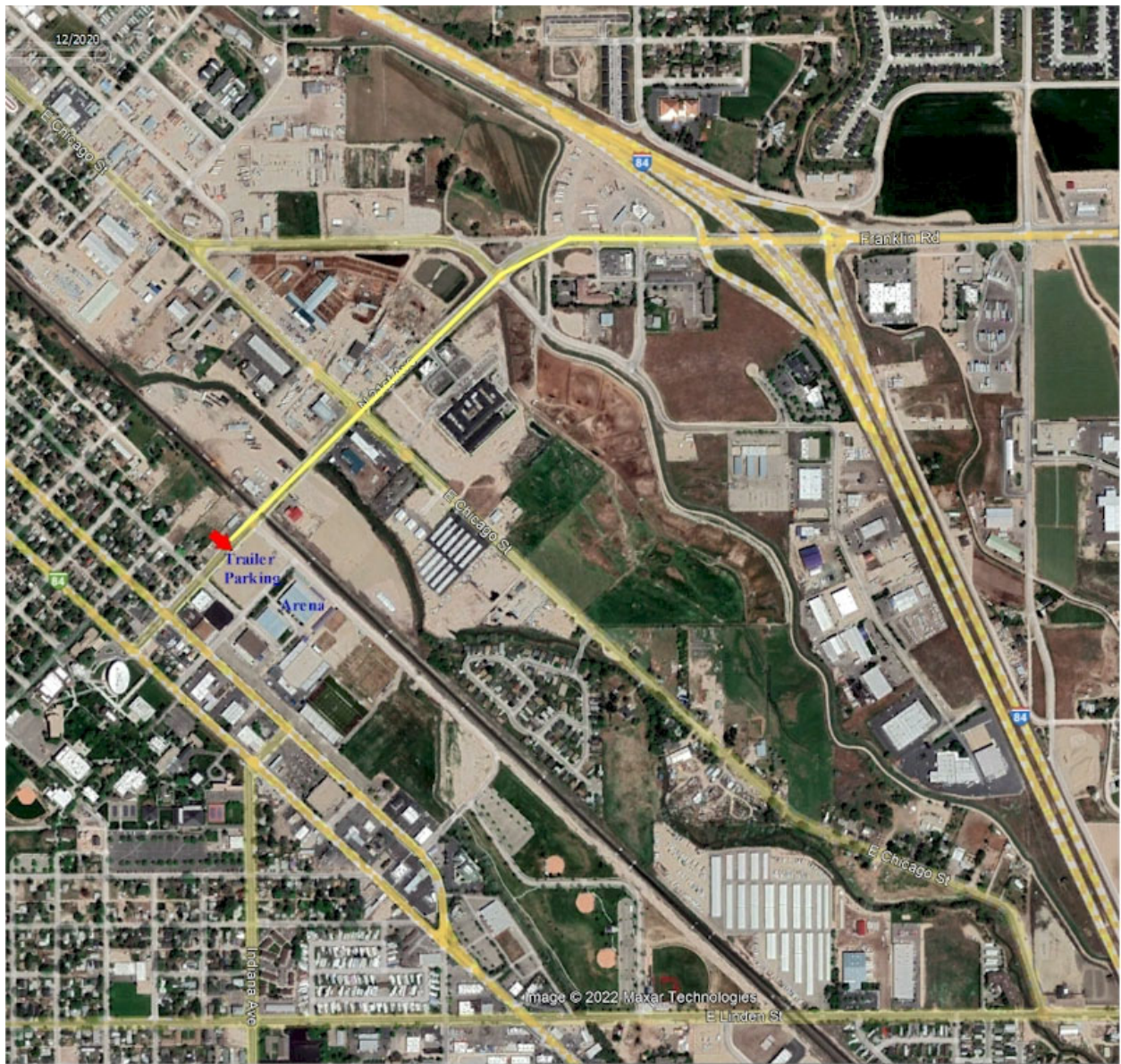
Aerial Photo showing Location and Access to Trailer Parking Area